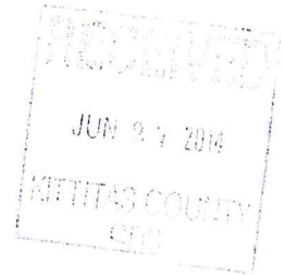
EXHIBIT C 1